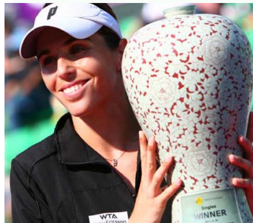
No Spaniard had won a hardcourt title on the WTA since Anabel Medina Garrigues at Canberra in January 2006.