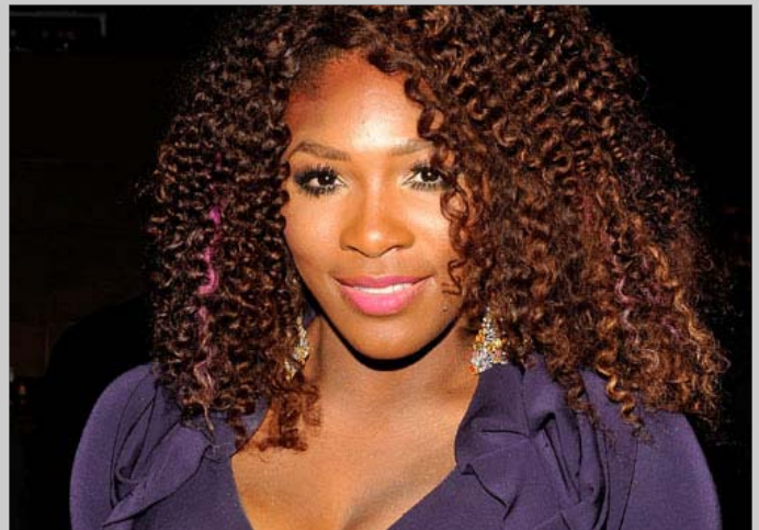
Serena Williams, who reached the final of the US Open in only her second Grand Slam back from almost a year out of the game, turns 30 on Monday.