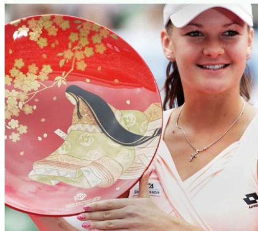
Radwanska's other title this year came at Premier level too at Carlsbad. She beat Zvonareva in that final as well.