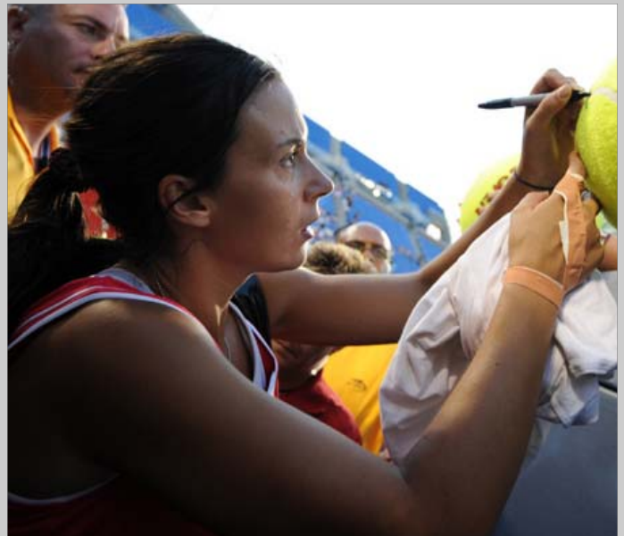
Marion Bartoli celebrated her 27th birthday on Sunday, the day she won her first round match at the China Open against Iveta Benesova, 36 64 75.