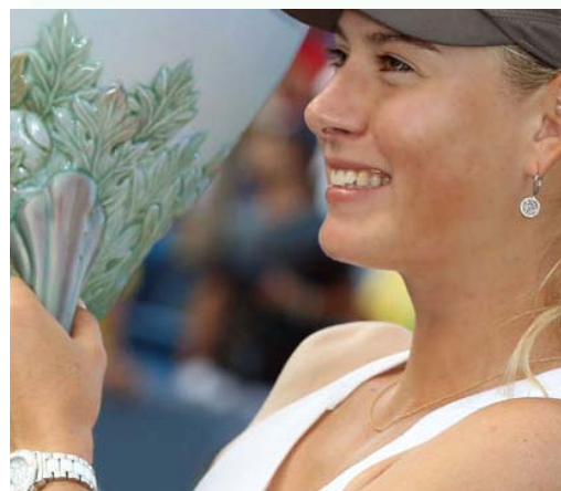
Sharapova won back-to-back three-setters in the semis and final. She is now 11-0 in three-setters this year.