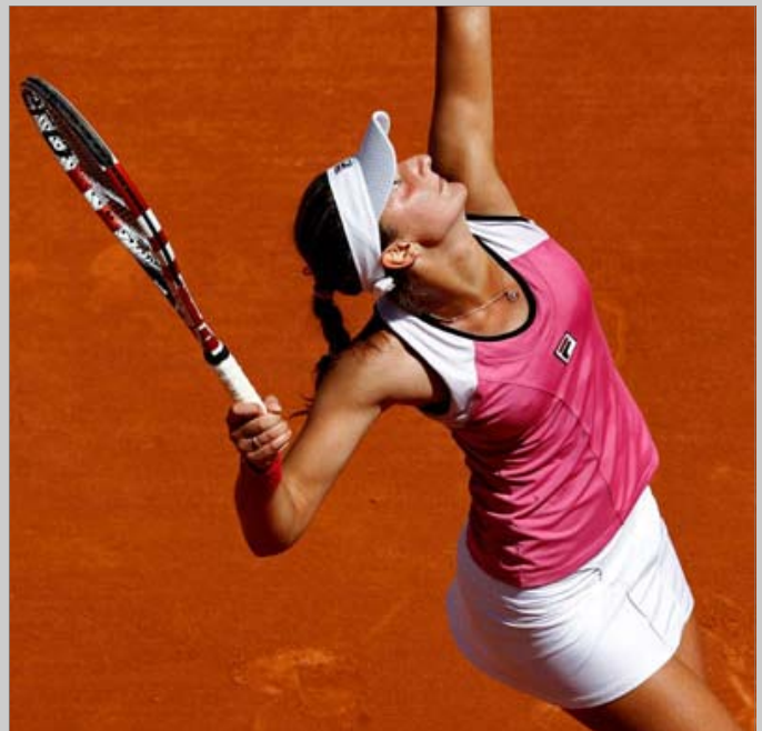
Romanian rising star Irina-Camelia Begu turns 21 years old this Friday.

Govortsova, Olga (BLR) August 23, 1988 Begu, Irina-Camelia (ROU) August 26, 1990